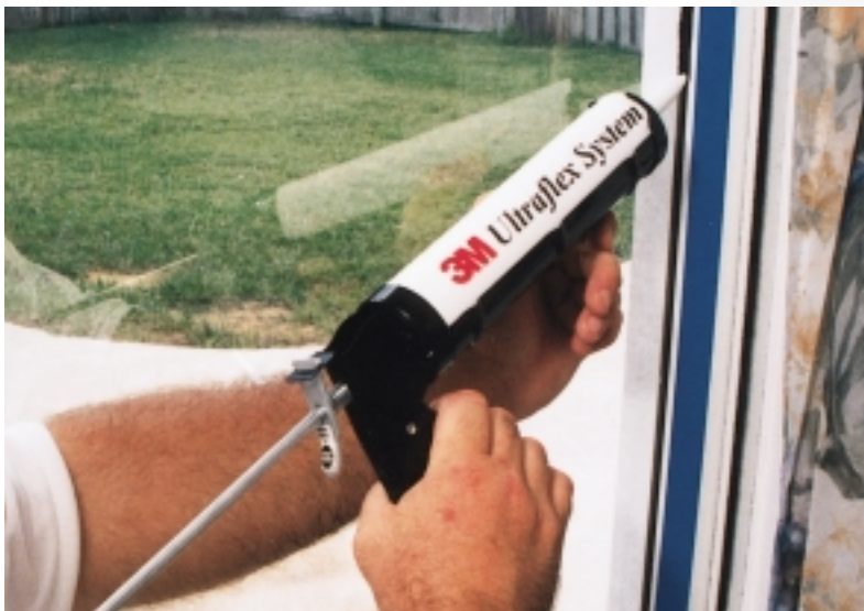
3M™ Ultraflex Window System

3M Ultraflex Window System allows the frame to bend and twist to accommodate a variety of stresses, increasing personal safety from flying glass. For ease of use, the Ultraflex System offers a simple, more cost effective attachment system when compared to more bulky mechanical attachment alternatives. The Ultraflex System will replace the window gasket and blend with the frame system to look as good as the gasket it replaces.