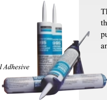
Silicone Structural Adhesive

The flexibility of this system will also increase the ability of the system to cycle due to blast pulse and wind storm energies that create positive and negative pressure effects or by twisting forces associated with earthquakes. In addition, resistance to smash-and-grab and forced-entry impacts can also be improved with the installation of Ultraflex.